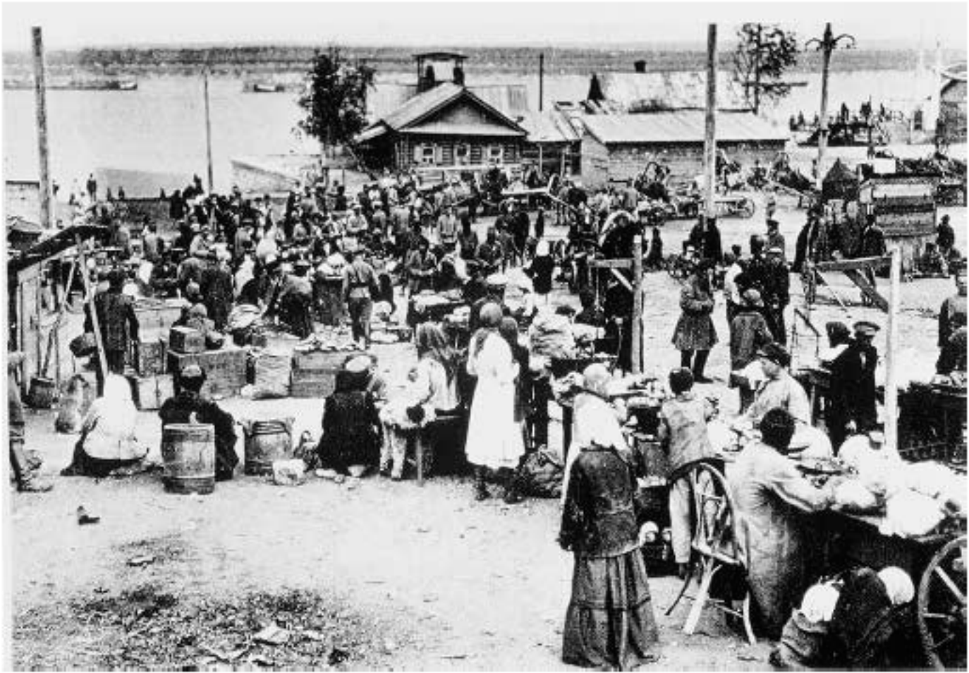
11. A country market in the 1920s

be able to induce the peasants to sell their grain. But the persisting shortage of consumer goods, together with spiralling inflation, nullified the policy. In Siberia it is reckoned that in the first half of 1918, 12 million puds of grain were requisitioned, but 25 million were converted into moonshine. Knowing that there was still plenty of grain available, on 14 May the Bolsheviks announced a ‘food dictatorship’ whereby all surpluses above a fixed consumption norm would be subject to confiscation. In minatory fashion the decree warned that ‘enemies of the people’ found to be concealing surpluses would be jailed for not less than ten years. In theory, peasants were still to be recompensed – 25% of the value of requisitions would be in the form of goods, the rest in money or credits – but according to the most generous estimate, only about half the grain requisitioned in 1919 was compensated for, and in 1920 only around 20%. Some indication of what the policy meant in practice can be gleaned from the fact that in 1918, 7,309 members of food detachments, most of them workers, were murdered as they tried to seize surpluses.