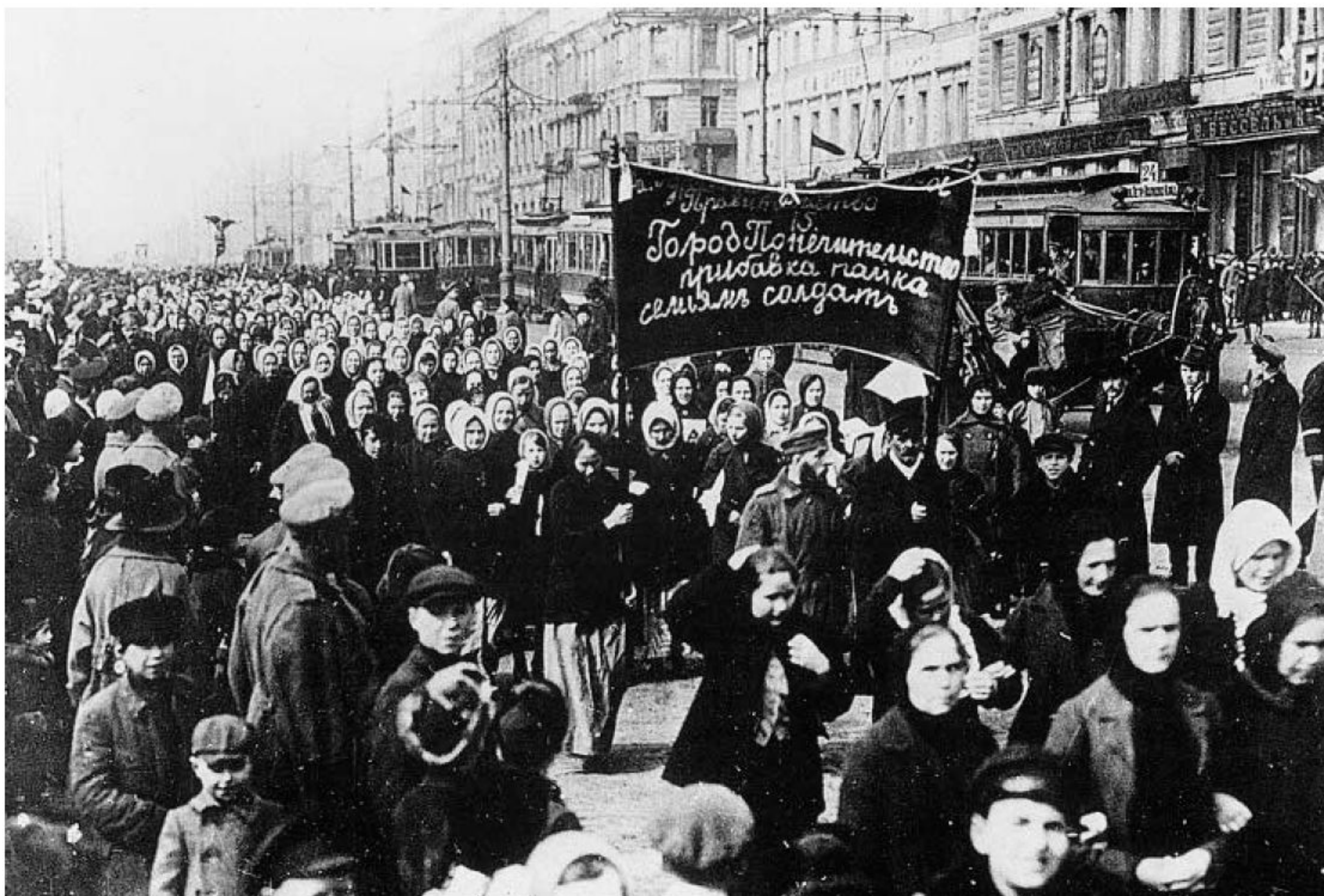
1. International Women's Day, 8 March 1917