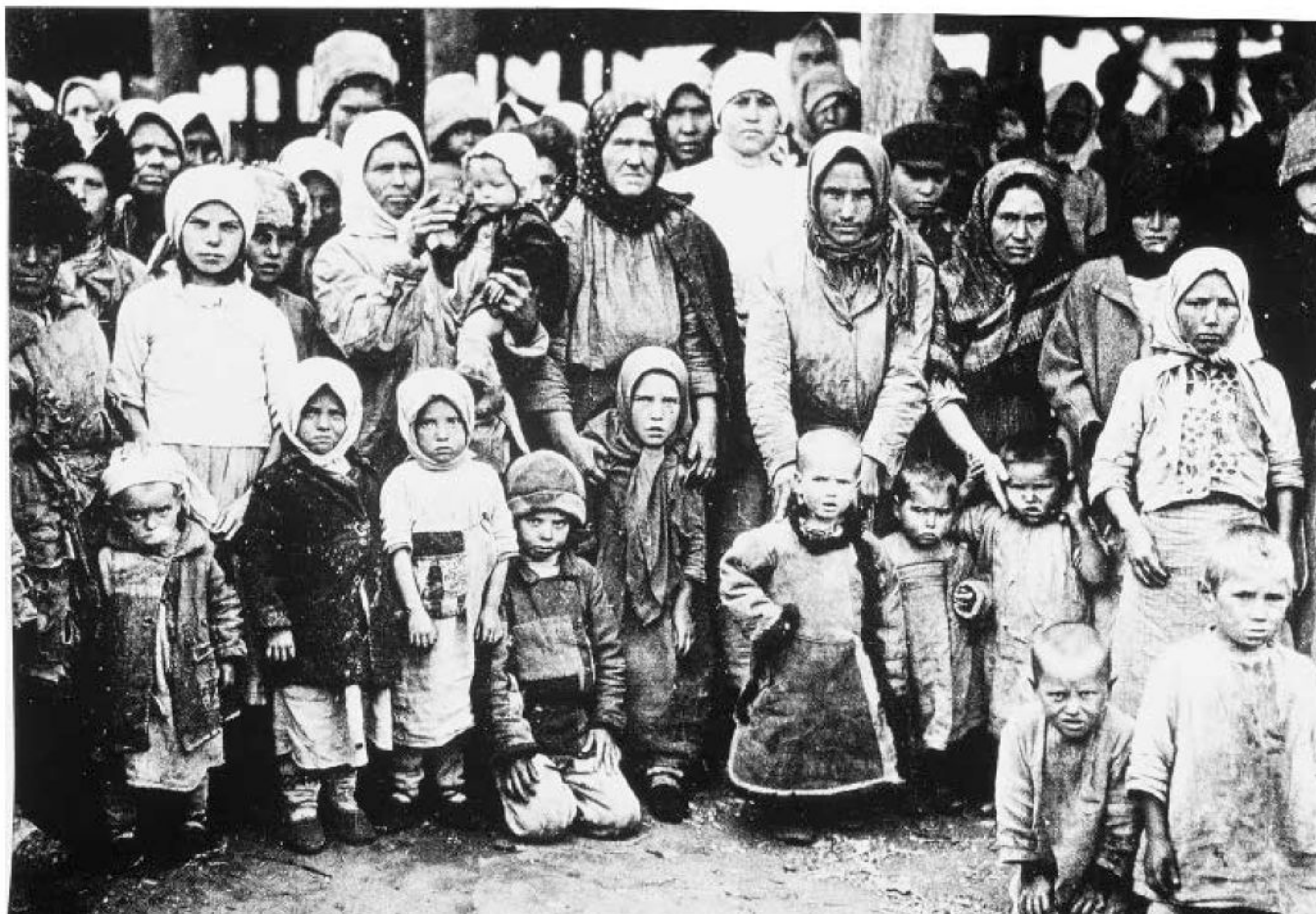
14. Famine 1921-2