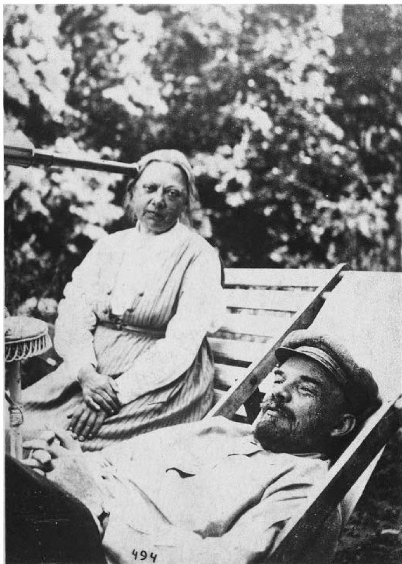
15. Krupskaya and Lenin, Gorki, 1922