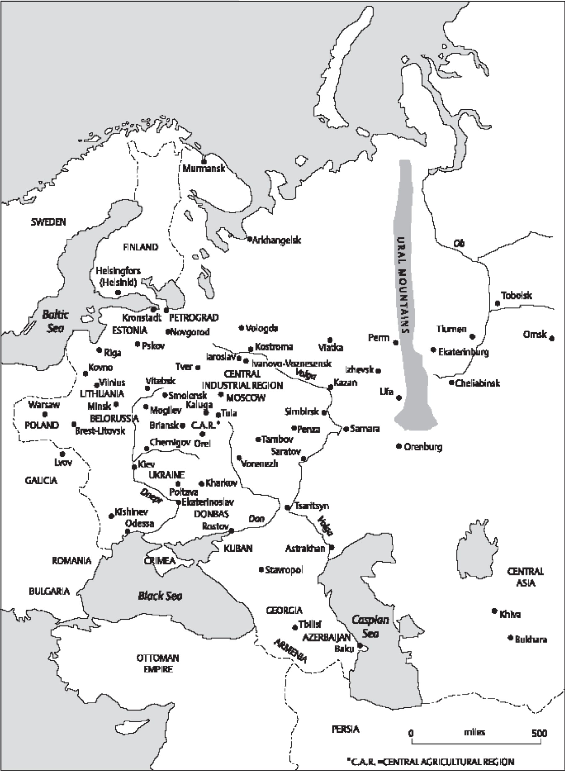
Map 1. European Russia on the eve of 1917