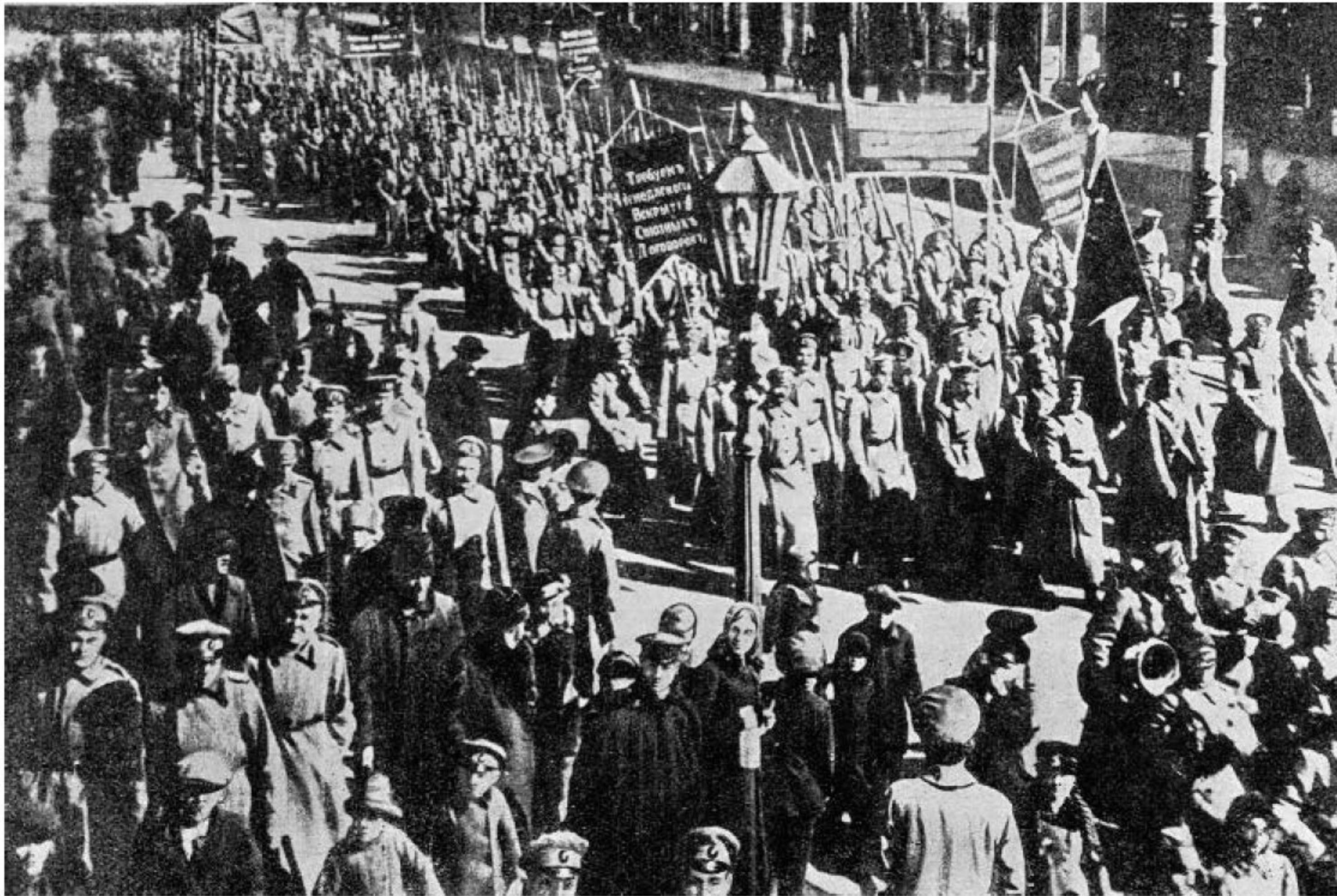
4. Russian soldiers demonstrating in Petrograd, April 1917