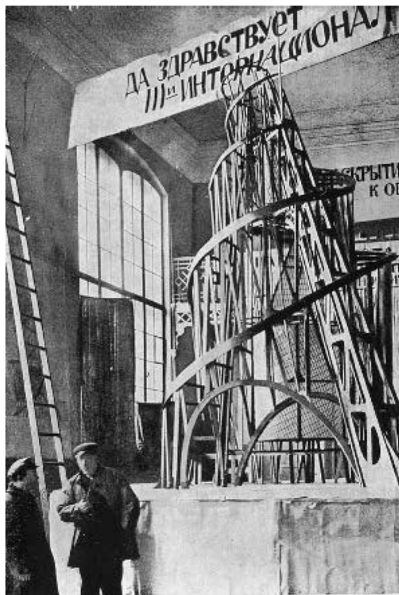
18. The model of Vladimir Tatlin's Monument to the Third International