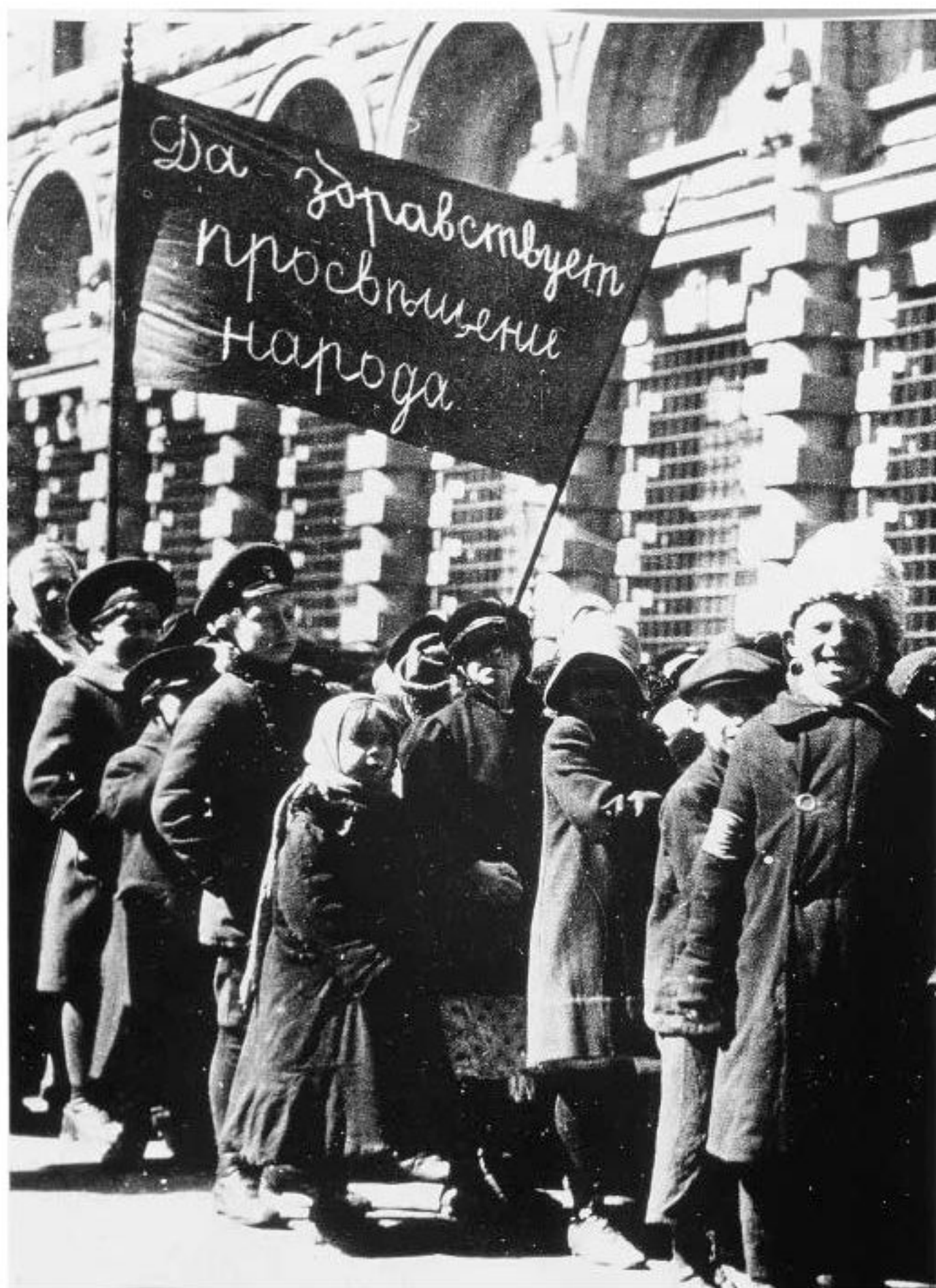
17. Children's demonstration