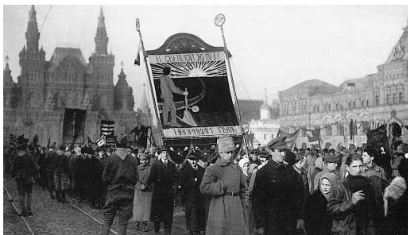
21. Demonstration: ‘Let us direct our path towards the shining life.’

It is beyond question that ideology was of central importance in determining the course of the Bolshevik revolution. All Bolsheviks – including Stalin – believed in the Marxist vision and it is impossible to comprehend the scale of their ambition, their astounding energy, and their ruthless determination unless one takes the ideas that inspired them seriously. Their victory in the civil war, for example, is inexplicable except in terms of their unwavering conviction that they were exercising dictatorship on behalf of a temporarily ‘declassed’ proletariat. However, the civil war also reminds us that Bolshevik ideology changed over time, in many respects profoundly. In 1917 Lenin spent valuable time developing Marx’s notion of the withering away of the state. By 1918 Lenin’s State and Revolution was an irrelevance. Within months, Lenin had come to see in the massive strengthening of the state the sole guarantee of advance towards socialism. Not all Bolsheviks agreed. Through the civil war and into the 1920s, Bolsheviks understood their ideology in different ways – the barracks’ vision of communist society associated with War Communism, the productivist vision associated with NEP – and the sharp disagreements that arose out of these differing perspectives were just as important in determining the course of the revolution as the beliefs and values shared in common. By