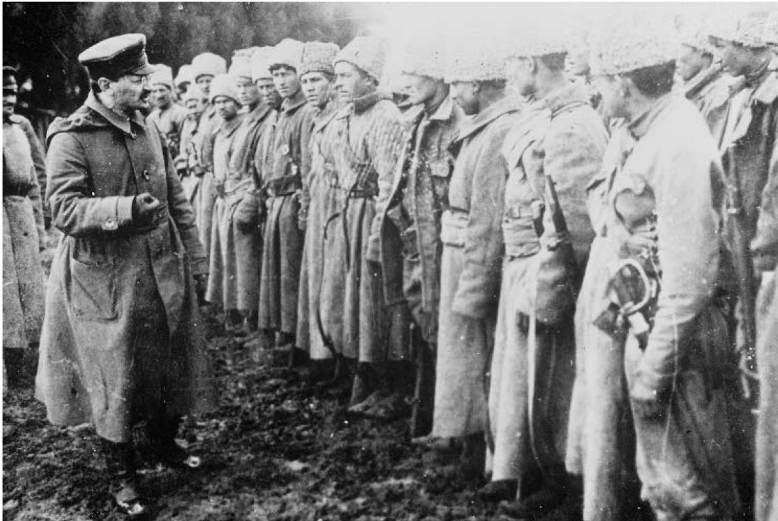
8. Trotsky reviewing the Red troops during the civil war, 1917