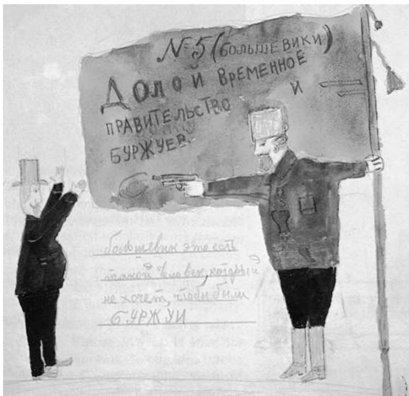
13. A child's cartoon. The caption reads 'A Bolshevik is a person who doesn't want there to be any more burzhui .'