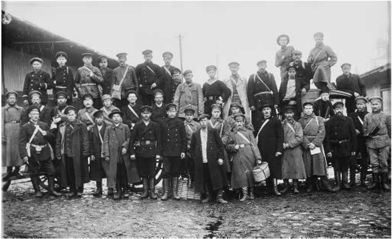
12. A food requisition group, 1918

But even as the kombedy were multiplying in autumn 1918, the party leadership was beginning to doubt the wisdom of the policy. In November the Sixth Congress of Soviets, commenting on the ‘bitter dashes between kombedy and peasant organs of power’, called for their abolition.