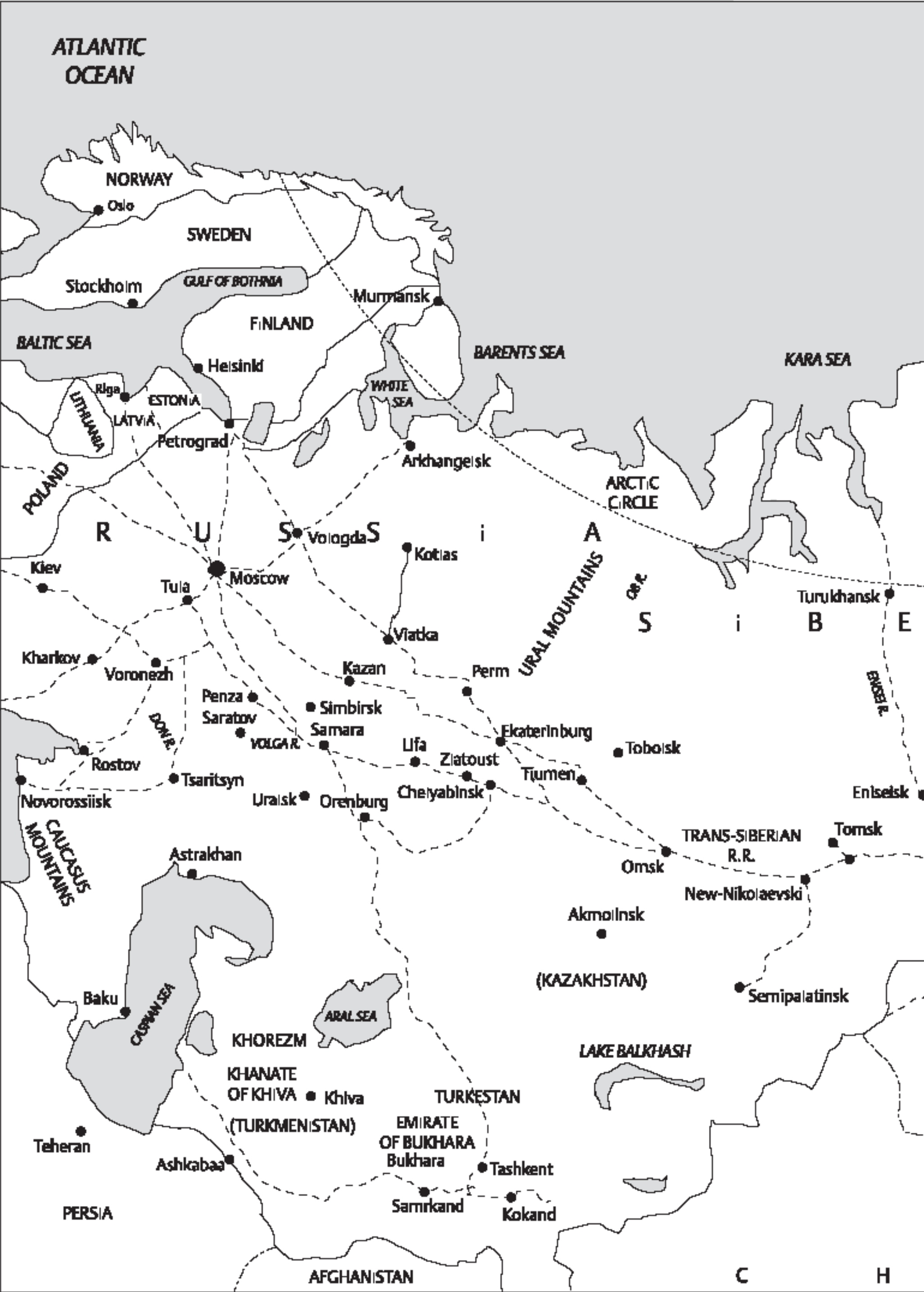
Map 2. The Soviet state at the end of the civil war