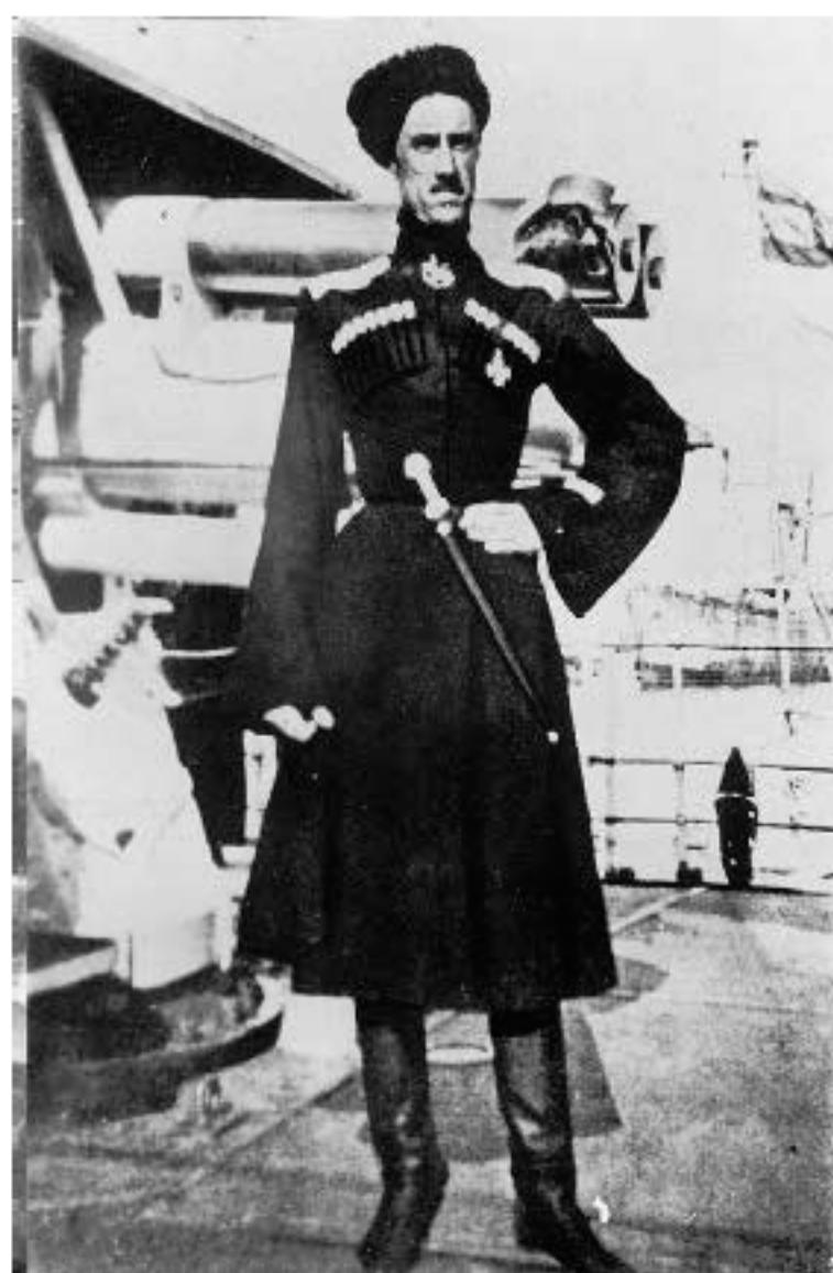
9. Baron Wrangel leaves Russia

line – compared with a combined total of 2 million White troops by spring 1920. Moreover, although the quality of both armies was evenly matched – both, for example, suffered from massive levels of desertion – the Reds had the edge so far as leadership was concerned. The Volunteer Army was formed around a core of 4,000 experienced officers; but this ceased to be an advantage once the Reds compelled ‘military specialists’ to enlist; and over time, the Reds proved able to nurture officers of talent such as V. K. Bliukher and M. N. Tukhachevsky. In addition, the Whites were riven by personal animosity, principally between Denikin and Kolchak and Denikin and Wrangel; the conflict between Trotsky and Stalin proved less damaging since the Bolsheviks had a binding ideology and a recognized leader. Finally, the Bolsheviks were clearly superior in the organizational sphere. The Red Army had a unified centre of command in the Revolutionary Military Council of the Republic, and was supported by such institutions as the Defence