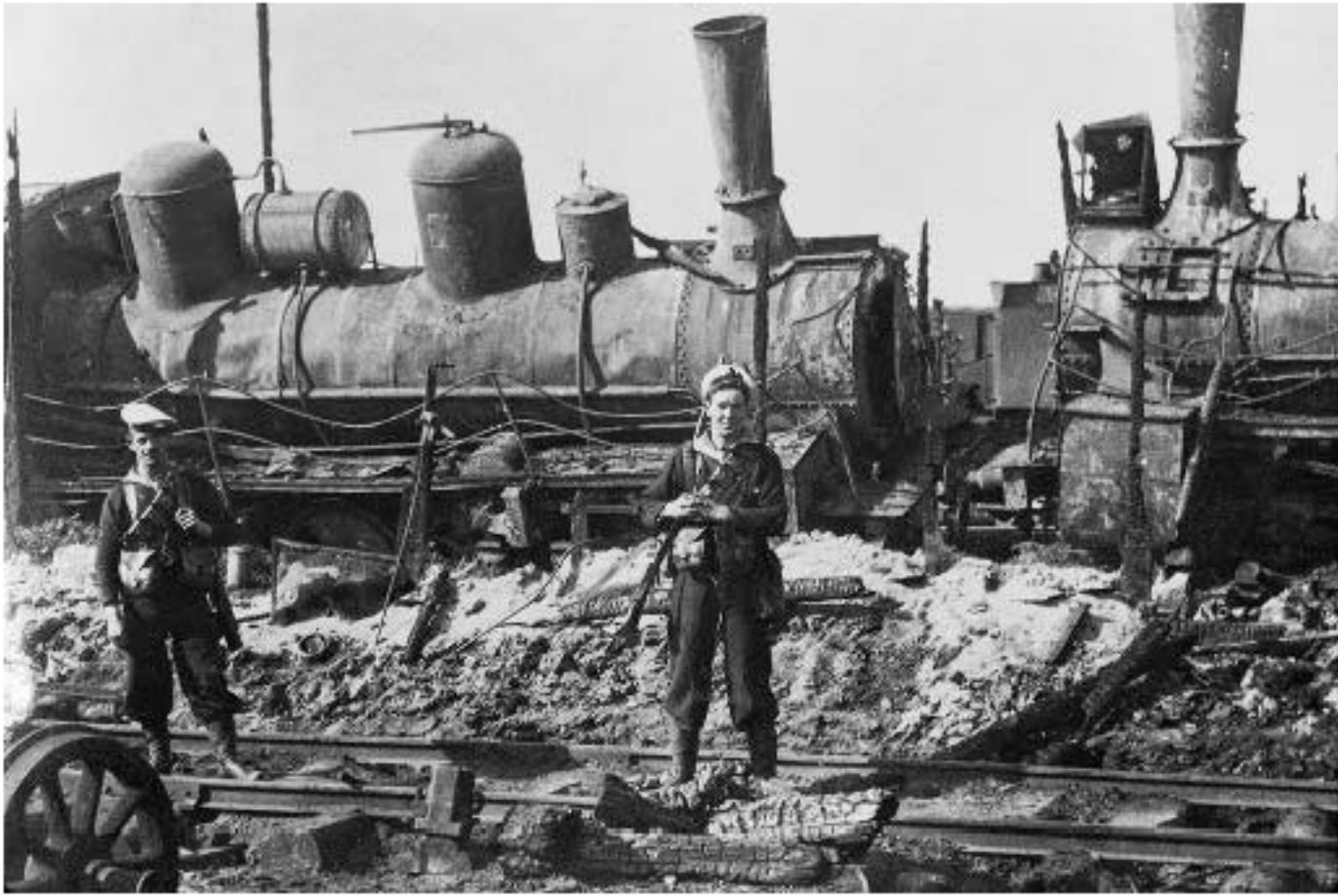
10. Derailed train with two Red Army soldiers

widespread popular disaffection with the Bolsheviks, evident, for example, in the Left SRs' failure to oppose the deeply unpopular committees of poor peasants. This was in part, then, a failure of political leadership. Yet the opposition parties were caught by the dilemma of all civil wars, which leave little space for third parties. Despite their fury at the government, most workers and peasants identified the struggle of the Reds with defence of the revolution and when the Bolsheviks said that one was either for them or against them, it had a compelling logic.