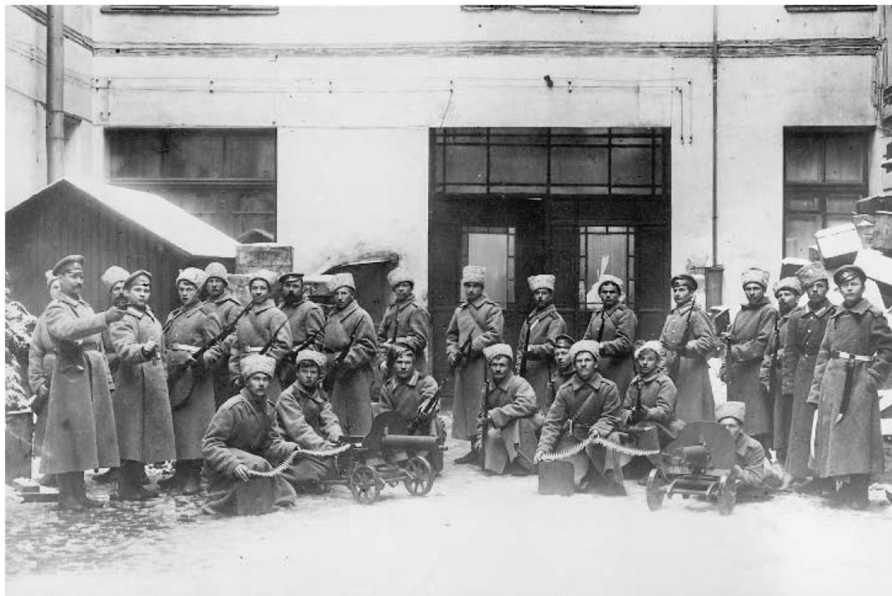
7. Red Guards in Ekaterinburg