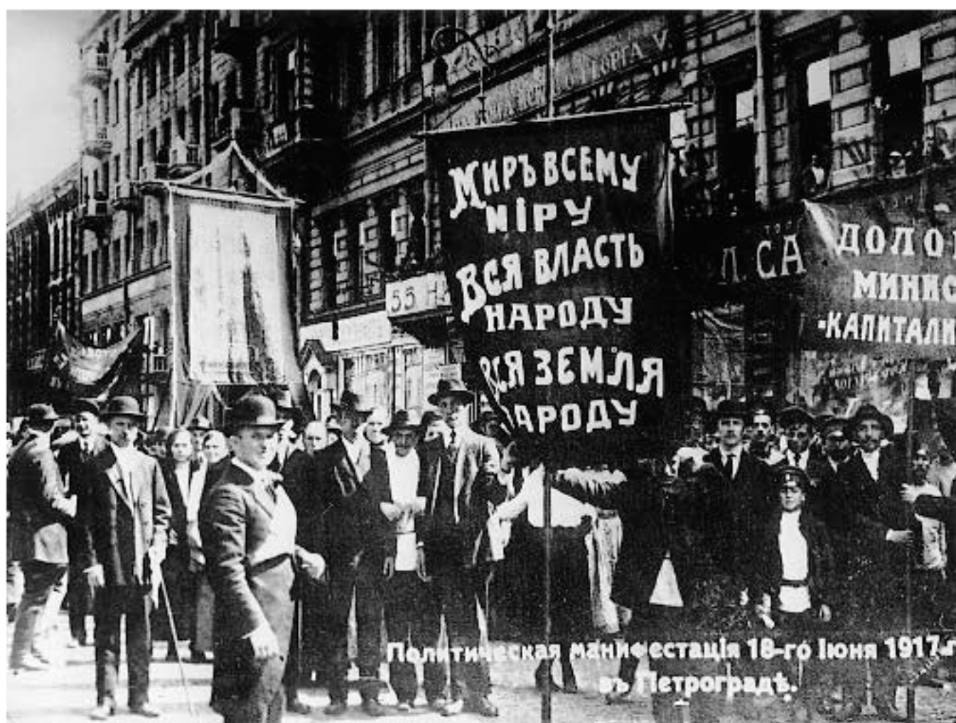
2. A political demonstration in Petrograd, 1917

Nadezda Krupskaja, upon her return to Russia in early April: 'Everywhere people stood about in knots, arguing heatedly and discussing the latest events. Discussion that nothing could interrupt!' Yet from the first, the scope of the revolution was in dispute. For the reluctant revolutionaries of the Provisional Government the overthrow of the tsar was an act of national self-preservation driven by the need to bring victory in war. For the lower classes, liberty and democracy meant nothing short of a social revolution that would bring about the complete destruction of the old structure of authority and the construction of a new way of life in accordance with their ideas of justice and freedom. It was only a matter of time before the social contradictions masked by the common political language would become exposed.