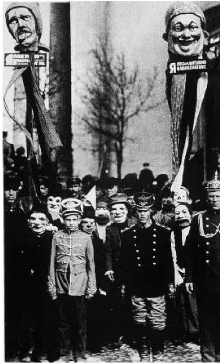
16. Anti-capitalist demonstration, 1920s

might disenfranchise middle and even poor peasants for hiring nurses or workers during harvest time on the grounds that this rendered them exploiters. Members of religious sects or parish councils might be consigned to the ranks of the kulaks.