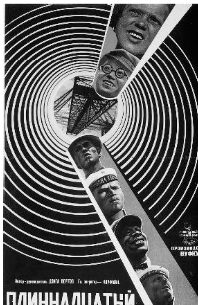
20. Constructivist poster design for Dziga Vertov's film, The Eleventh

secure narrative, and moral certainties. Yet if the 1920s saw genuine pluralism in literature, it also saw the steady rise of censorship. In 1922 the Main Directorate for the Protection of State Secrets in the Press was set up, charged with censoring domestic and imported printed works, manuscripts, and photos. By July 1924, 216 foreign films had been banned because of the 'threat to the ideological education of workers and peasants in our country'. This was stricter censorship than had pertained after 1905.