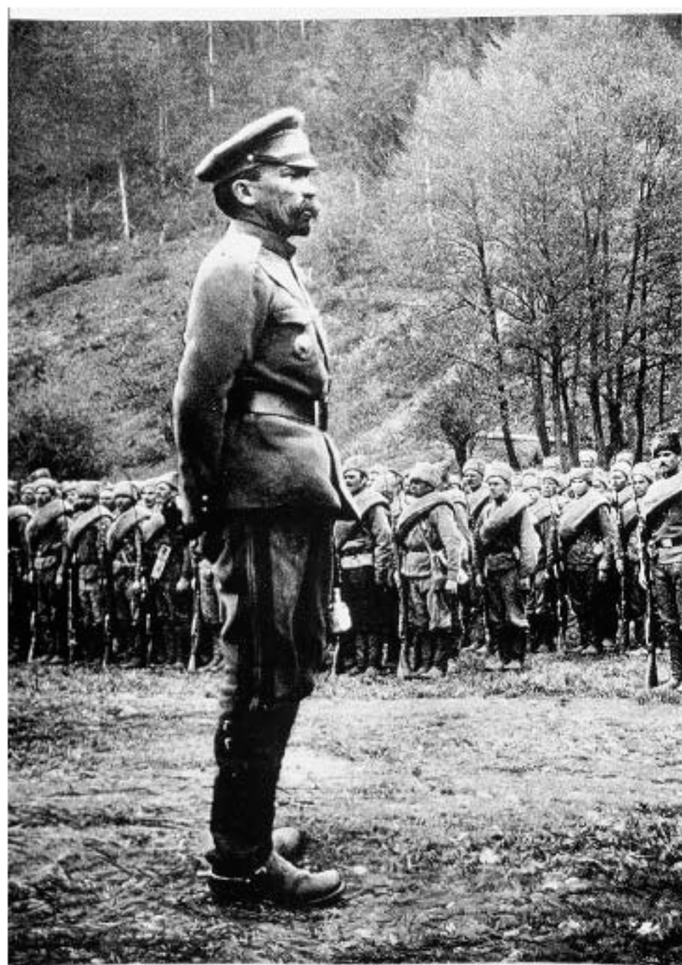
From February to October

the need for a military dictatorship to save Russia from 'anarchy'. Kerensky and Kornilov agreed on the need to establish 'firm government' – code for suppressing the Bolsheviks – and each hoped to use the other to achieve his more particular ends. On 26 August, however, Kerensky lashed out at Kornilov after he received what seemed to be an ultimatum demanding that military and civil authority be placed in the hands of a supreme commander. Accusing Kornilov of conspiring to overthrow the government – and historians dispute as to whether he actually was – he sent a telegram relieving him of his duties. When Kornilov ignored the telegram and ordered troops to advance on Petrograd, he appears to have moved into open rebellion. His attempted coup, however, was poorly planned and the dandestine