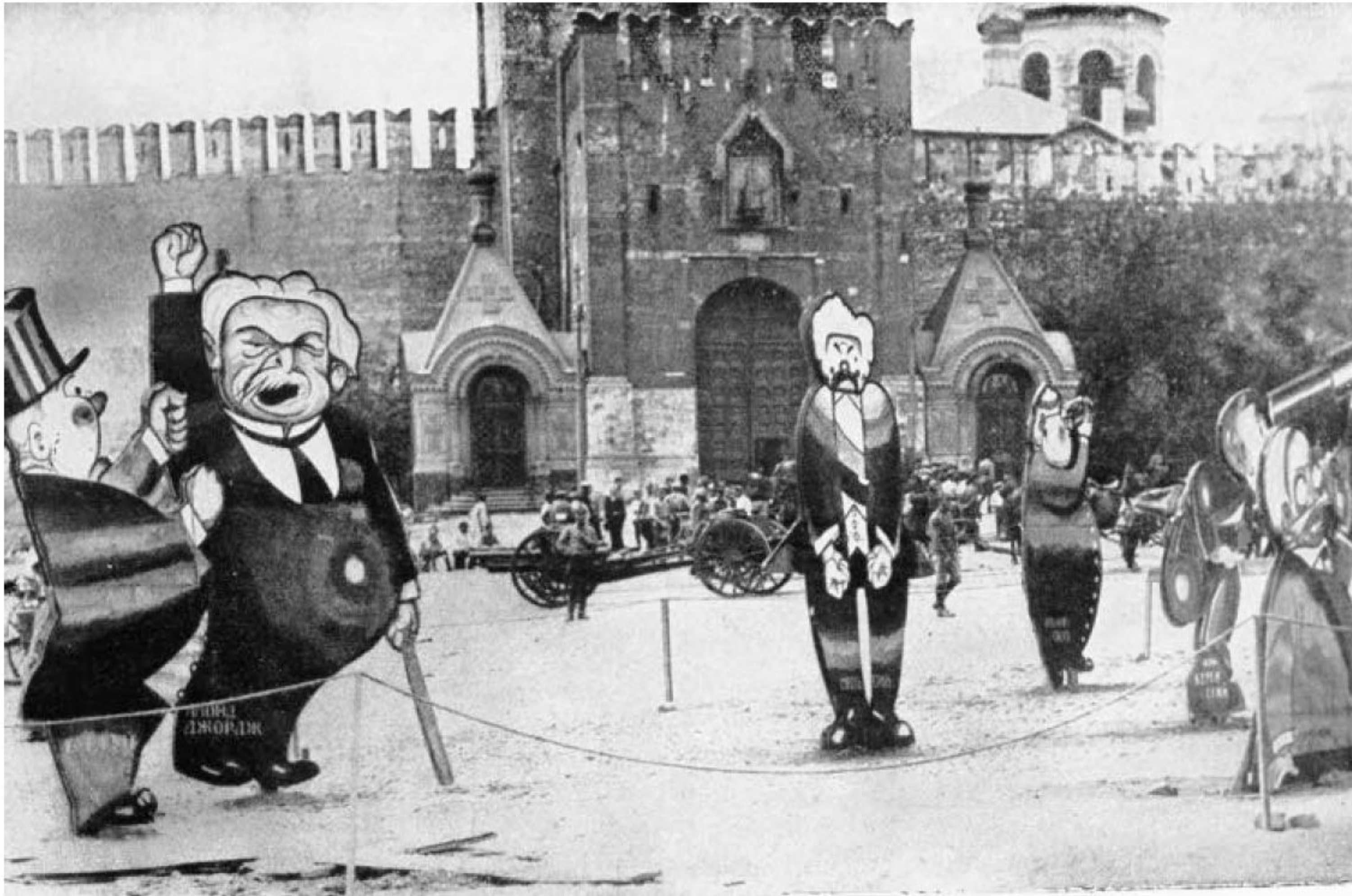
22. Red Square caricatures